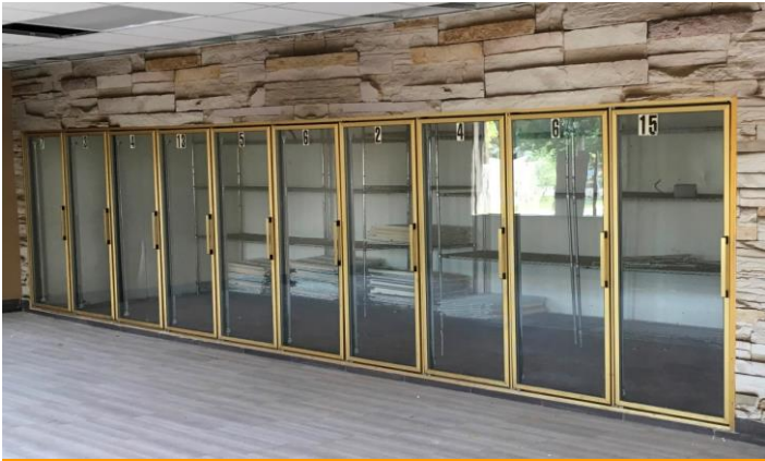
10 Door Walk In Cooler