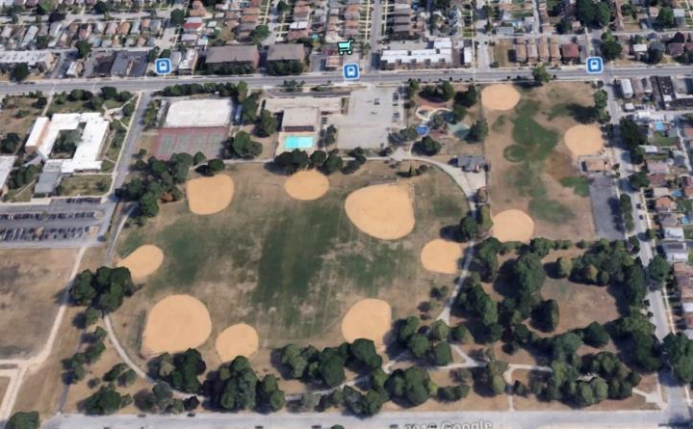
Mount Greenwood Park District Directly Across 111th St