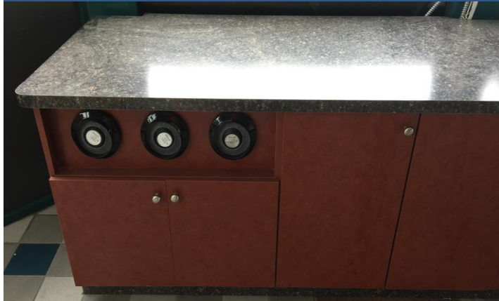
Brand new counters