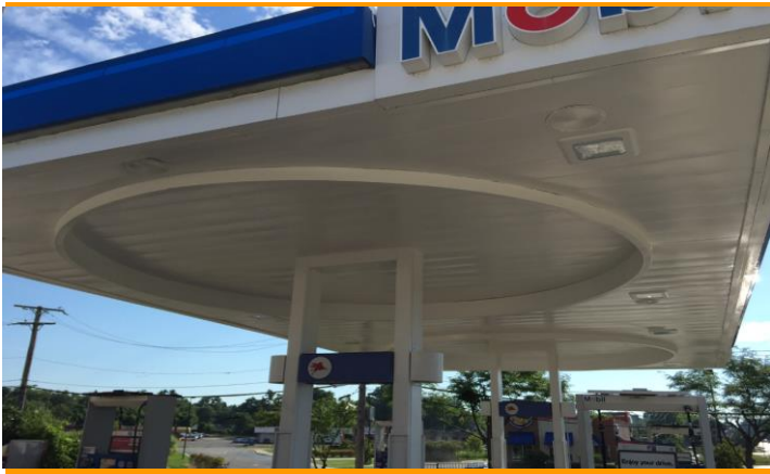
New LED lights

Mobil Station: 3480 Elizabeth Lake Waterford MI