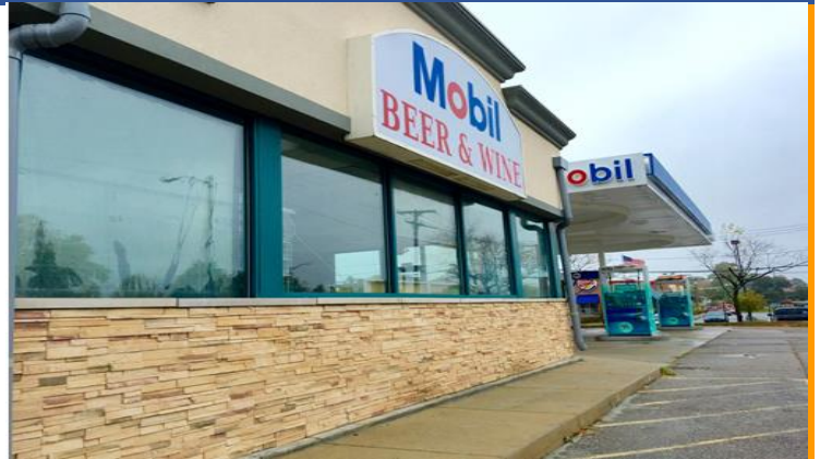
Newly remodeled building exterior

Mobil Station: 3480 Elizabeth Lake Waterford MI