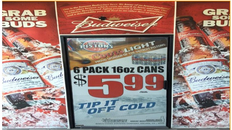
Beer & wine

Mobil Station: 3480 Elizabeth Lake Waterford MI