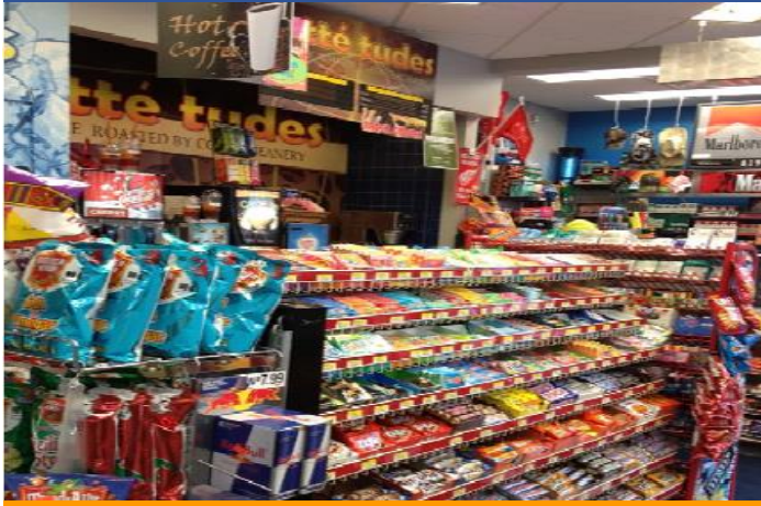
CITGO Station: 322 Main Romeo MI