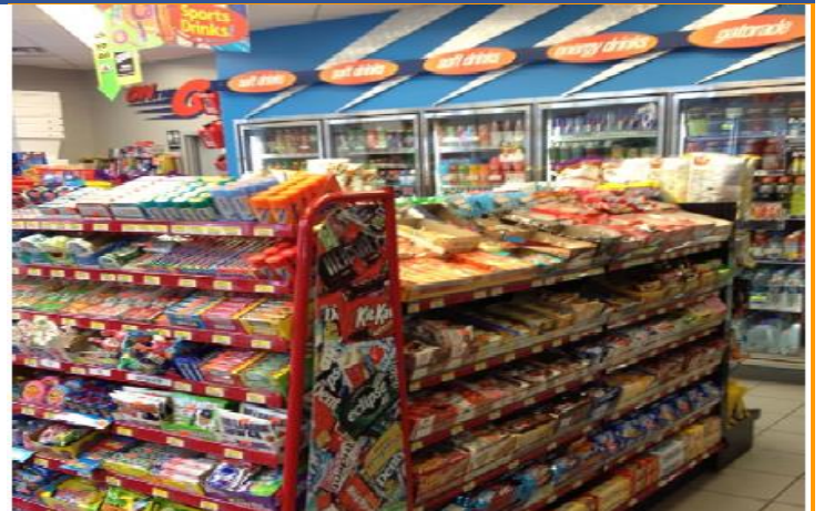
Revised 02 07 18