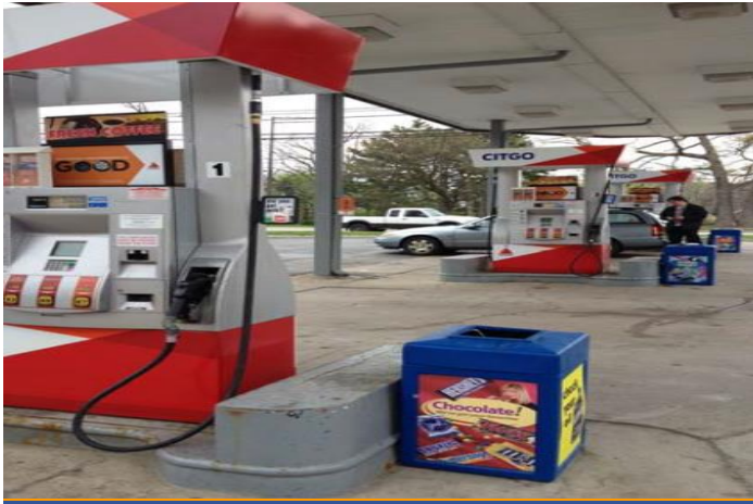
CITGO Station: 322 Main Romeo MI