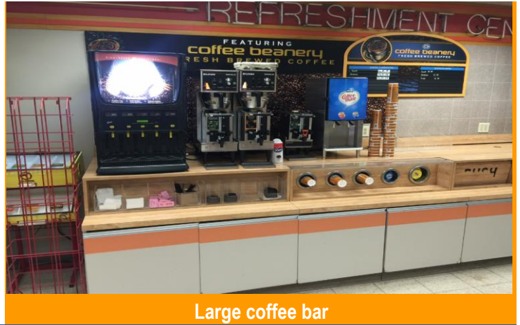
Large coffee bar