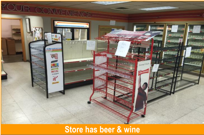
Store has beer & wine