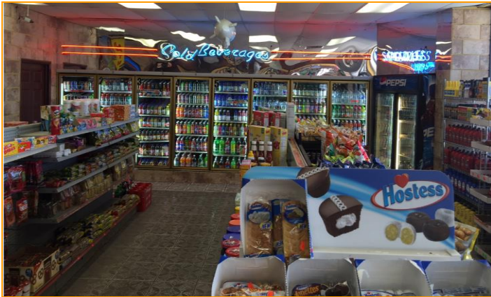
8 door walk in cooler