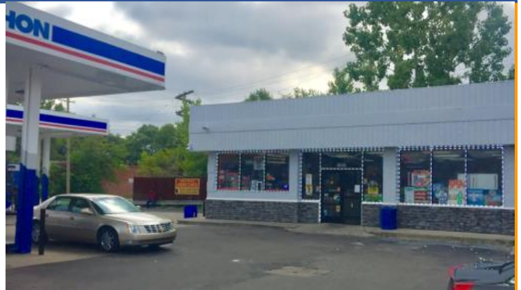
New building fascia and LED lights

Marathon Station: 13601 Plymouth Detroit MI